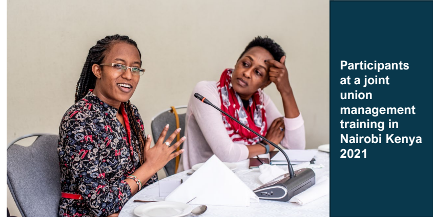
Participants at a joint union management training in Nairobi Kenya 2021

In midst of the full-fledged corona crisis SWP managed to begin implementation after recruiting a team in the 4 hubs. Six workplace programmes were developed and the Sustainable business platforms delivered opportunities to establish networks. Key outcomes was the initial positioning of SWP as a reliable and interesting initiative to explore for both companies and trade unions.